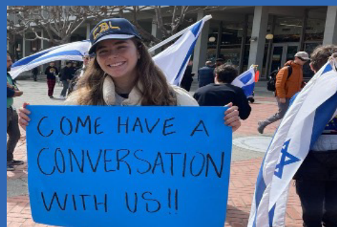
Club Z alumni protesting "Israel Apartheid Week" at UC Berkeley, March 2023