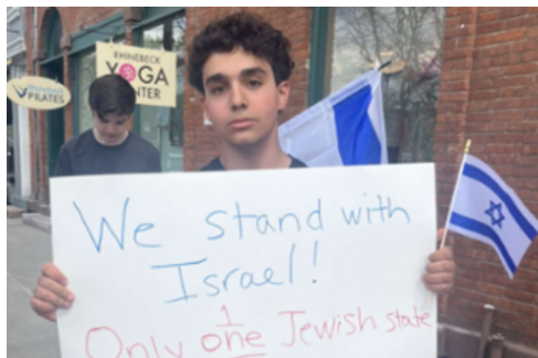
Club Z Westchester teens organize counterprotest, Rhinebeck, NY, April 2023

Club Z has been training and empowering teens to fight antisemitism, lies and misinformation in high schools and on college campuses since 2011.